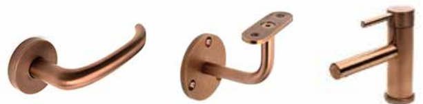
PVD architectural ironmongery

Sharp folds & appears as solid brass, bronze or copper