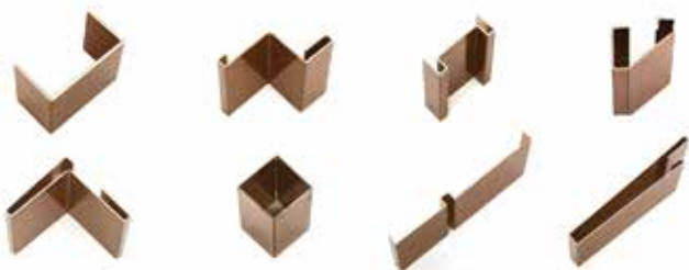
V-Grooved & folded PVD sheet

Sharp folds & appears as solid brass, bronze or copper