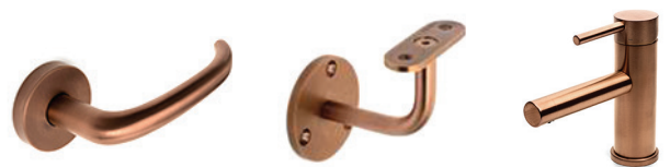
PVD architectural ironmongery

Sharp folds & appears as solid brass, bronze or copper